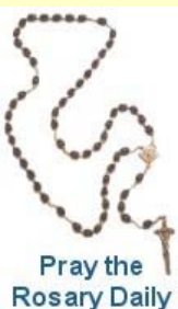
Pray the Rosary Daily